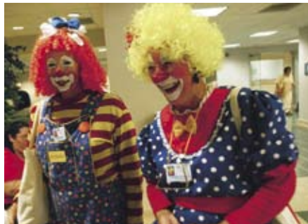
Volunteers spread smiles throughout the hospital